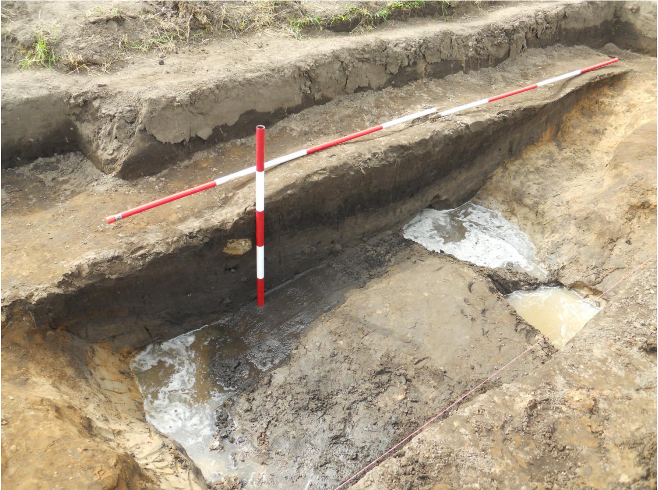
The ditch in Trench 1

We opened up three trenches. In Trench 1, after the plough-soil had been removed, indications of the linear ditch were immediately found. We were able to find the cut of the original ditch, albeit in a collapsed state, as well as some pottery, thought to be early Iron Age, and one rim sherd of what appears to be Roman grey ware. A ditch found in Trench 4, opened up to the West of trench 1, confirmed the continuity of the ditch and recovered further items of Iron Age pottery. Unfortunately, the ditch did what it was probably dug for in the first place, and rapidly accumulated water to a depth of twelve inches or so, precluding the excavation of the bottom of the ditch.