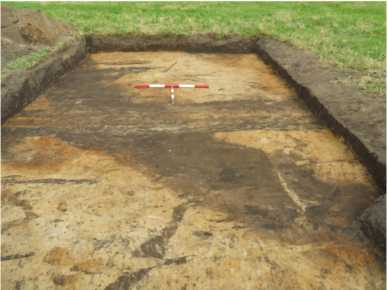
Ring ditch in Trench 2

Trench 3 failed to produce the unusual feature shown in the cropmarks, but a number of quite old, and modern, field-drains were investigated and further items of Iron Age pottery were recovered.