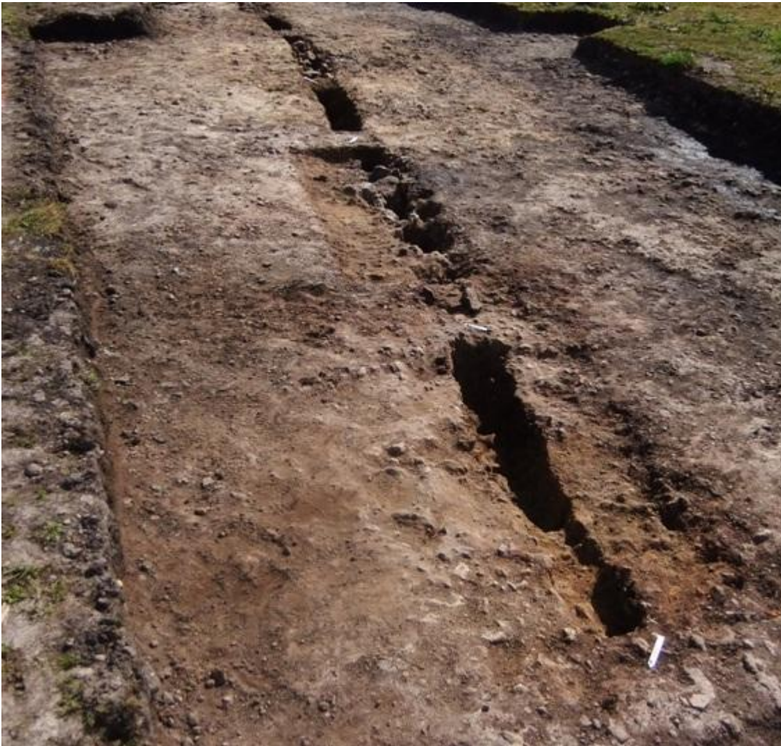
Intact sections of the palisade foundations in Trench AG

minor complication the palisade was successfully excavated, and by sheer chance uncovered a particularly interesting section, where there appeared to be three post pipes (these are holes that have a very precise form where the wood in the slot did not survive).