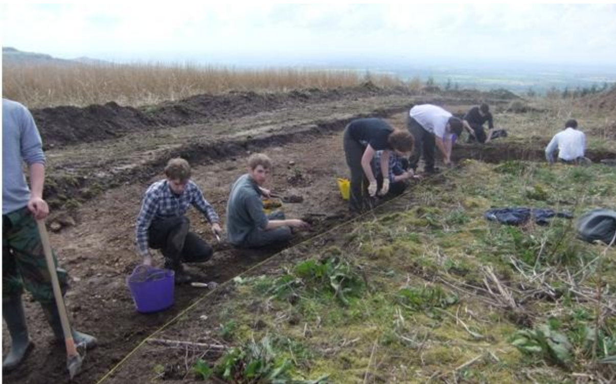
Some of the students at work in Trench AG

Although that sounds like a simple task, what became clear very quickly was that the ability to trowel well is something that can only be obtained through experience. During this we heard many subjective phrases about 'the texture and colour of the soil' and 'the feel of the surface'. By the end of the three weeks we were also using these seemingly bizarre phrases ourselves! We worked on the clearing of the trenches for several days, something that became increasingly difficult with the steady deterioration of the weather.