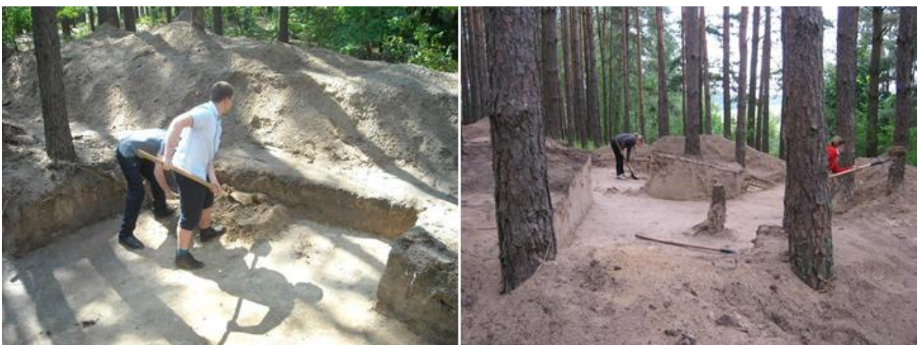
Figures 2 & 3: Shovels rather than trowels; unusual trench dimensions

As burials are placed either on top of the natural layer or just above it, the removal of top soil stops as soon as the natural or the top of the burial are visible. At this stage, the trench may be extended by the same method if the full extent of the burial is not within the excavated area.