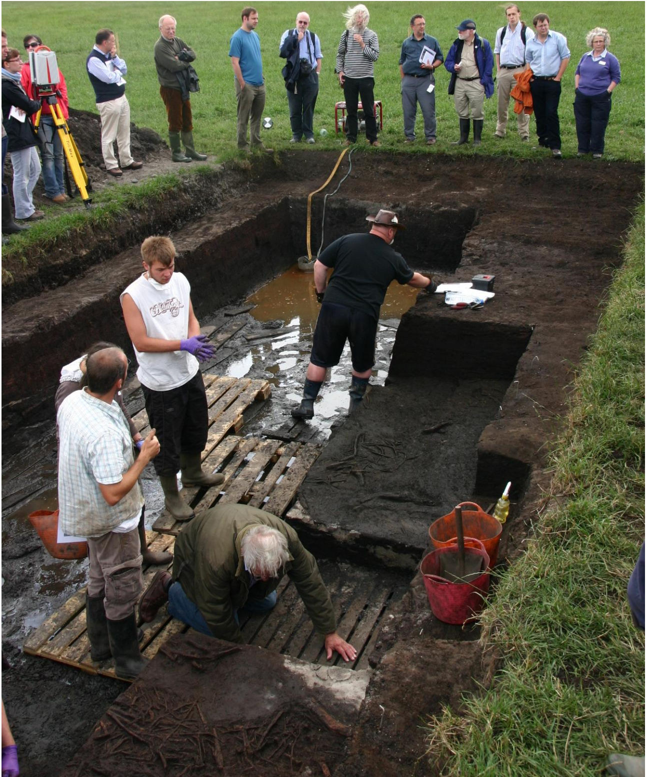
A site tour of Star Carr during the 2010 season of excavation