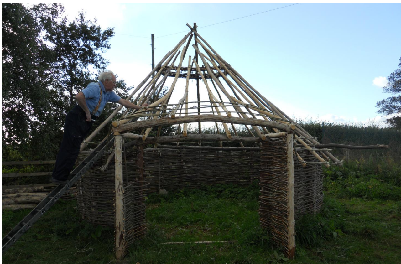
AND's reconstruction of an Iron Age round house in progress

In 2008, AND acquired the Vale of York Mapping Project transitions of cropmarks from English Heritage. This showed complex cropmarks to the North and West of the village as well as other smaller concentrations elsewhere.