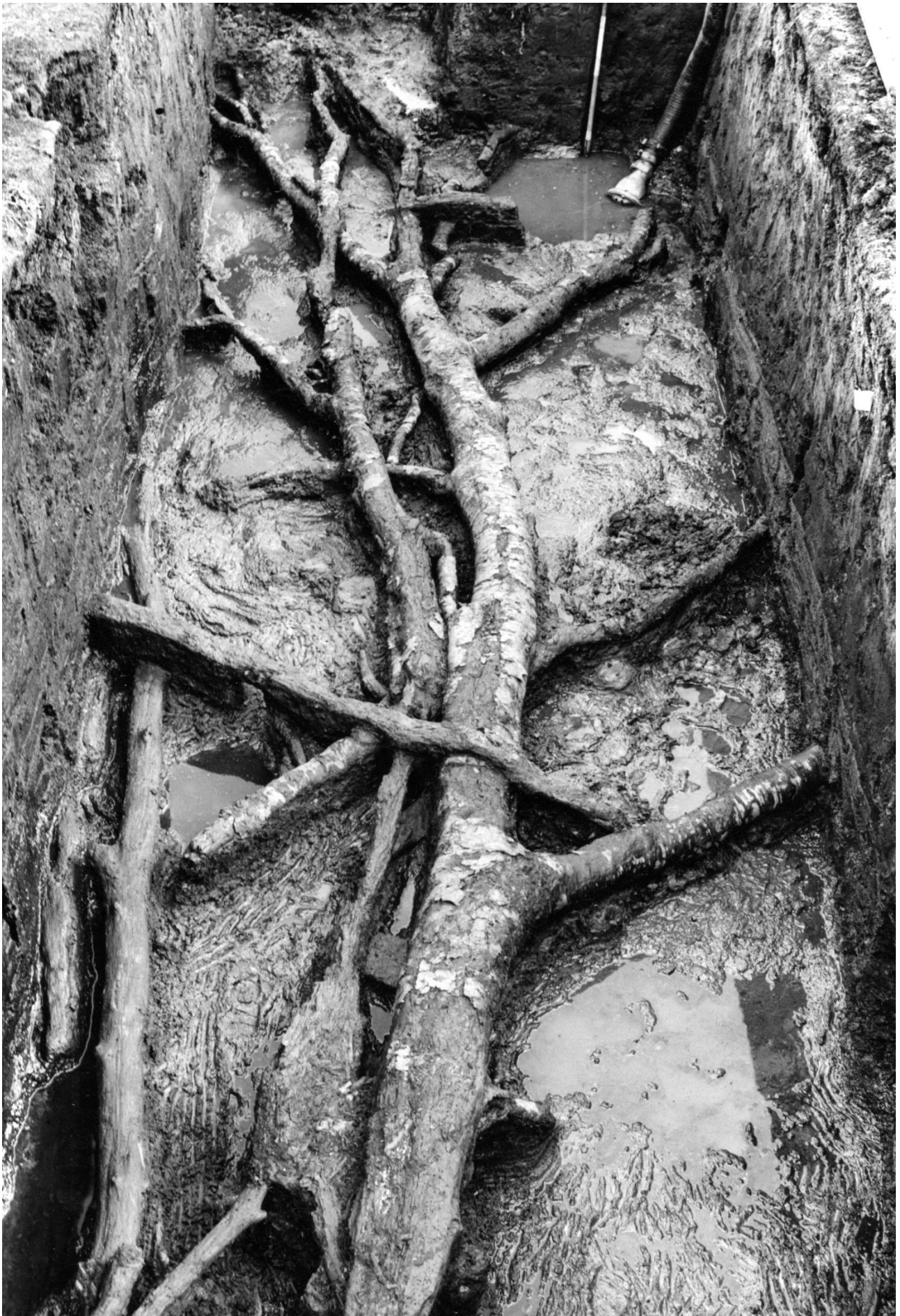
Birch tree excavated at Star Carr in 1950