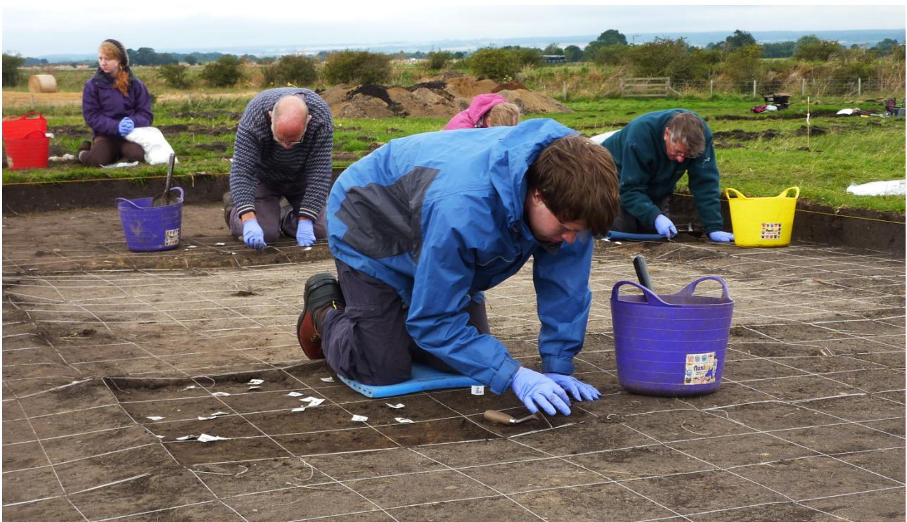
Sampling soil for chemical analyses at Flixton Island this summer

Thank you, yes it's fantastic! It basically funds a group of scientists to do further cutting-edge scientific research on finds and to do three or four more seasons of excavation. We have nearly twenty specialists, based both here in York and elsewhere who are leading experts in the country. So the money goes towards those people working on the Project and also the costs of doing scientific analyses.