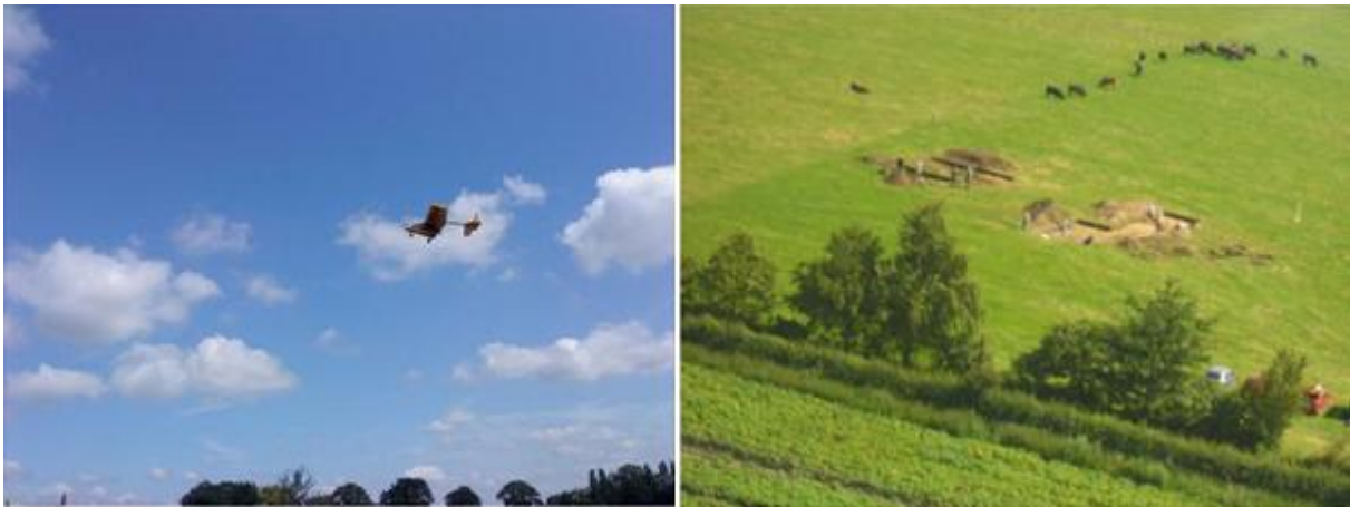
Aerial photography and view of the site

One of our members owns a plane and, at my request, flew over the site. He visited shortly afterwards with a request that he needed a light person with a good camera. Hannah was volunteered and agreed to go. Having swooped about the site taking pictures she returned an hour later with an ear-to-ear grin.