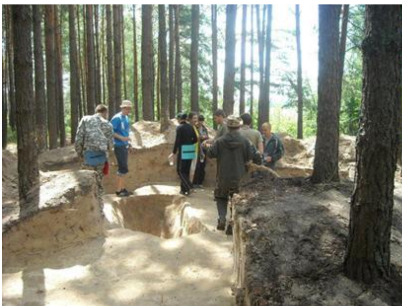
Figure 1: Position of trees around the trench

Here the archaeologist E. N. Osadchiy practises a different method. With twenty years of archaeological experience, he has come up with what seems to be the most practical approach to this regional problem.